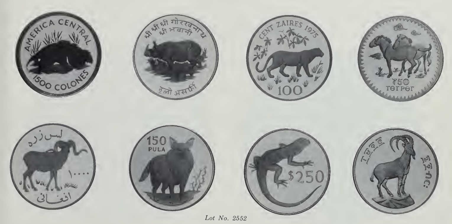
(Representative examples illustrated)

Extremely Rare Complete Set of Wildlife Conservation Coinage, 1974 through 1979, in gold 2552 and silver. All are Brilliant Proof, each in its own lucite container, arranged in four custom cases from the Royal Mint in Britain which struck the pieces. 24 Countries are included, each represented by two silver and one gold coin, six countries in each case. The silver coins are generally crown size, with one averaging around 28 grams and the other around 35. The gold coins are all 33.437 grams .900 Fine. The silver fineness varies from country to country.